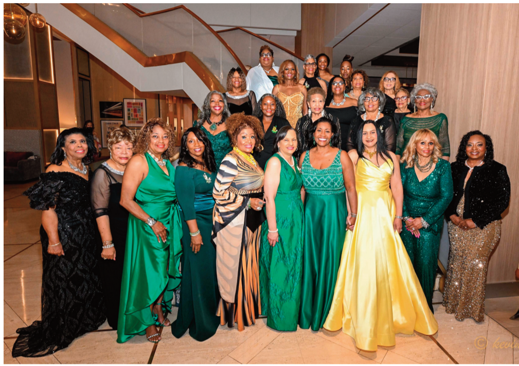
Members of The Greater Dallas Chapter of Chums Photo Credit:

Introducing Chums, Inc., also known as The Dynamic Divas of Dallas, bedazzled and delighted the metroplex during their chartering weekend. And...WHAT a fabulously memorable weekend it was! These outstanding daughters, mothers, and sisters, bonded in the spirit of friendship, community service, and fun, finely laced with intentional purpose, passion, unity, and inspiration, were nationally incorporated in 1946 in