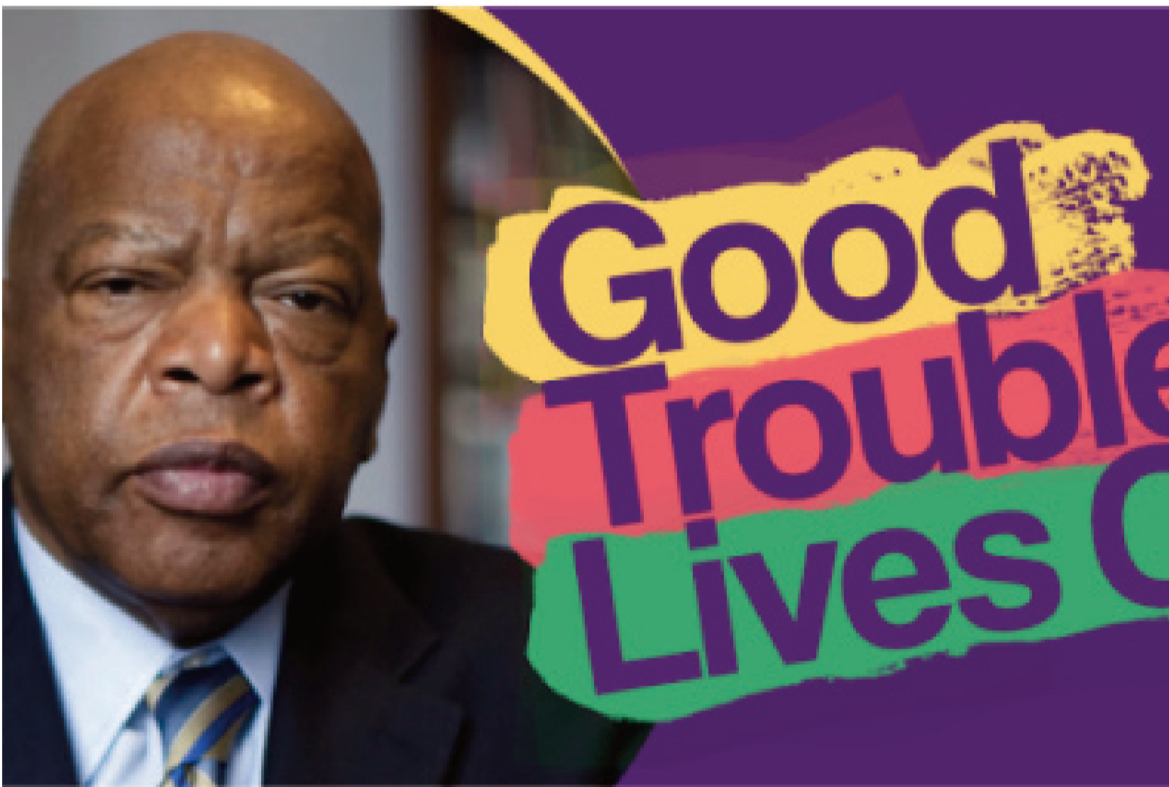
John Lewis