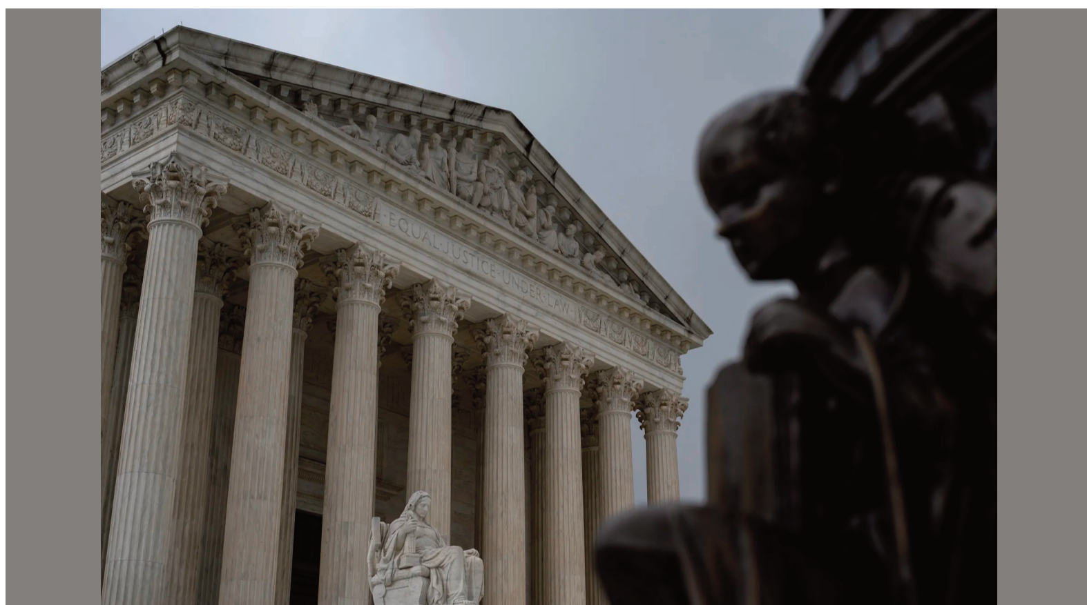
The United States Supreme Court building in Washington, D.C., on May 18, 2024.