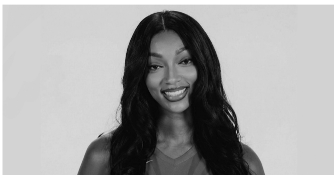
Angel Reese was traded from the Chicago Sky to the Atlanta Dream for future first round picks.

Atlanta's own, Taylor Rooks, took to Twitter/X to report the Chicago Sky would be trading Angel Reese, a two-time WNBA All-Star, to the Atlanta Dream. The news would later be confirmed by multiple outlets. The Dream acquired Reese in exchange for Atlanta's first-round picks in 2027 and 2028. The Dream also receives the right to swap second-round picks with the Sky in 2028. "I'm beyond grateful for the opportunity to join the Atlanta Dream organization," Reese said in a news release from the Dream. "I'm focused on continuing