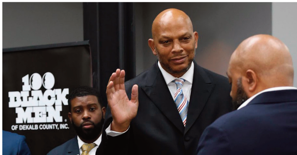
NBA Hall of Fame nominee and Basketball Legend Terry Cummings (left).

NBA Hall of Fame nominee and Basketball Legend Terry Cummings has officially become an honorary member of the 100 Black Men of DeKalb County, marking a powerful new chapter for the 100 Black Men and youth development across the region.