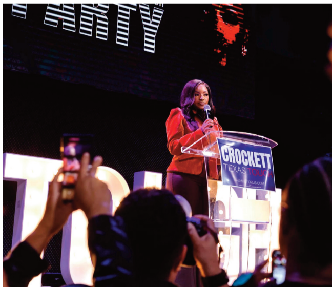
U.S. Rep. Jasmine Crockett, D-Dallas, speaks at her election watch party on Election Day for the Texas primary in Dallas on March 3, 2026.